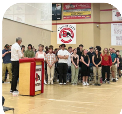
SHS Scholarship Awards Night