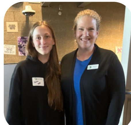
GPHS Scholarship Awards Night