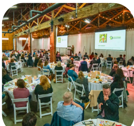
Our Community Impact Breakfast