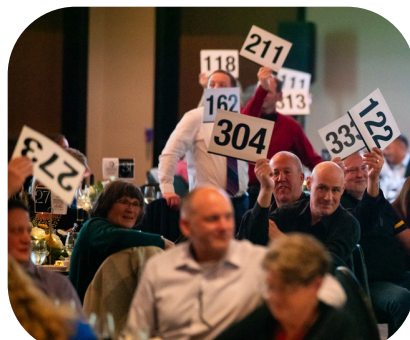
Guests bidding at last year's auction