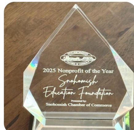
2025 Nonprofit of the Year from the Snohomish Chamber, voted on by the community