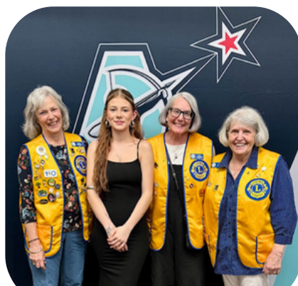
AIM Scholarship Awards Night